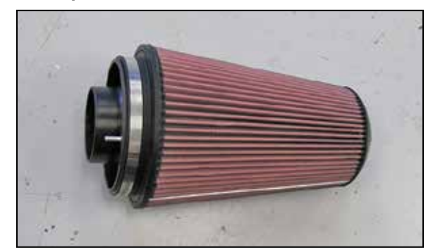
14. Install the adapter assembly into the K&N ^{\rm @} air filter and secure with the provided hose clamp.

NOTE: Be sure to add a drop of the provided thread locker to each stud before installing into the adapter.