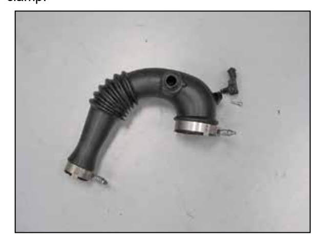
20. Remove the inlet temperature sensor from the factory intake tube.