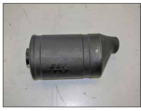
16. Install the end cap into the canister and secure with the provided hardware.