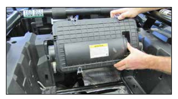
5. Loosen and remove the two hose clamps that secure the fresh air and clean air ducts to the air filter housing. Remove the air filter housing from the vehicle.

NOTE: K&N Engineering, Inc., recommends that customers do not discard factory air intake.