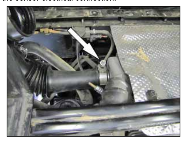
8. Loosen the hose clamp securing the intake tube to the turbo inlet and then remove the tube from the vehicle.