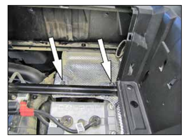
9. Remove the two nuts and bolts shown that secure the heat shielding to the chassis. NOTE: On some models there may be a lip on the drivers side of the heat shield which will need to be folded flat.