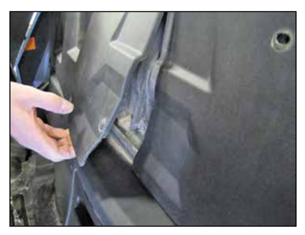
3. Pull back the inner lower corners of the back panels to gain access and remove the two air filter housing mounting bolts.

NOTE: Six of these bolts will be reused in a later step.