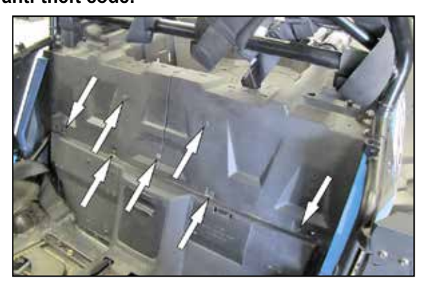
2. Release the locking leaver and Remove the (rear) seats from the vehicle and set aside. Remove the eight bolts shown that secure the rear panels.

NOTE: Disconnecting the negative battery cable erases pre-programmed electronic memories. Write down all memory settings before disconnecting the negative battery cable. Some radios will require an anti-theft code to be entered after the battery is reconnected. The anti-theft code is typically supplied with your owner's manual. In the event your vehicles anti-theft code cannot be recovered, contact an authorized dealership to obtain your vehicles anti-theft code.