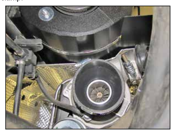
19. Install the provided coupler hose (08667) onto the turbo inlet and secure with the provided hose clamp.