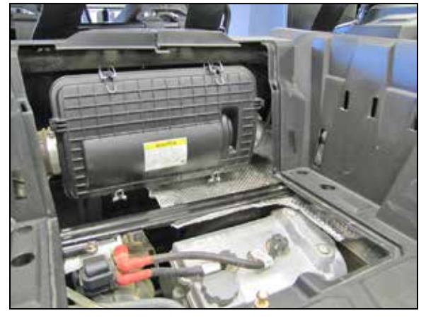
4. Release and lift off the engine cover.