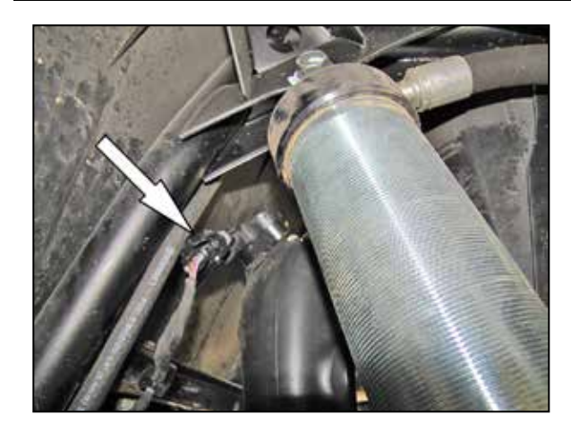
7. Release the clip securing the inlet temperature sensor electrical connection and then disconnect the sensor electrical connection.