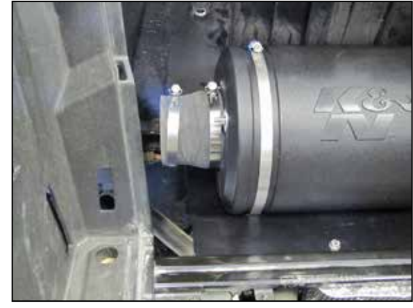
18. Install the provided coupler hose (084055) onto the filter adapter and secure with the provided hose clamp.