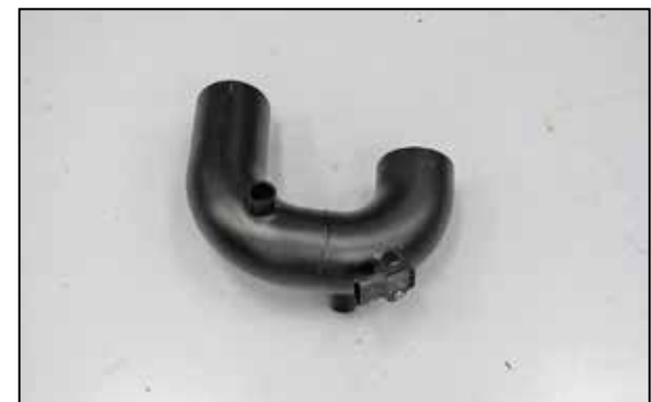
21. Install the inlet temperature sensor into the K&N® intake tube and secure with the provided hardware.