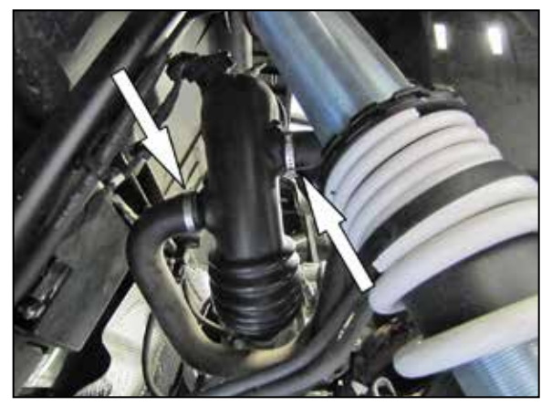
6. Release the clamps that secure the BOV hose and crank case vent hose to the intake tube and then disconnect the hoses from the tube.

NOTE: K&N Engineering, Inc., recommends that customers do not discard factory air intake.