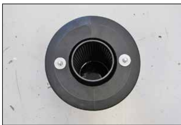
15. Install the filter assembly into the K&N® filter canister and secure with the provided hardware.