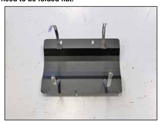
10. Install the two provided large hose clamps through the filter base plate as shown.