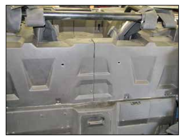
12. Reinstall six of the eight bolts removed in step #2. Reinstall the seats.

NOTE: the two upper air filter housing bolts will not be reused and the locations left blank.