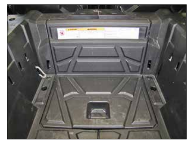
23. Reinstall the factory engine cover.