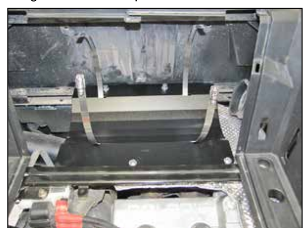
11. Install the filter base plate assembly as shown using the provided hardware.