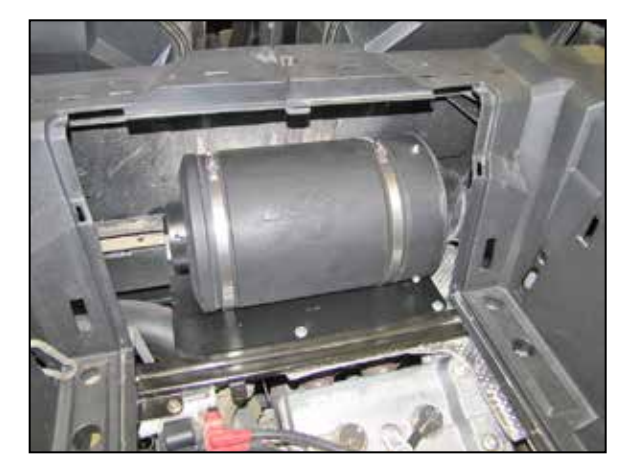
17. Install the filter canister assembly onto the mounting tray and connect the fresh air inlet hose. Adjust the canister and hose for best fit and then secure the canister and hose with the hose clamps. NOTE: Due to differences in the production factory foil heat shield, the heat shield may need to be reformed to allow the canister and