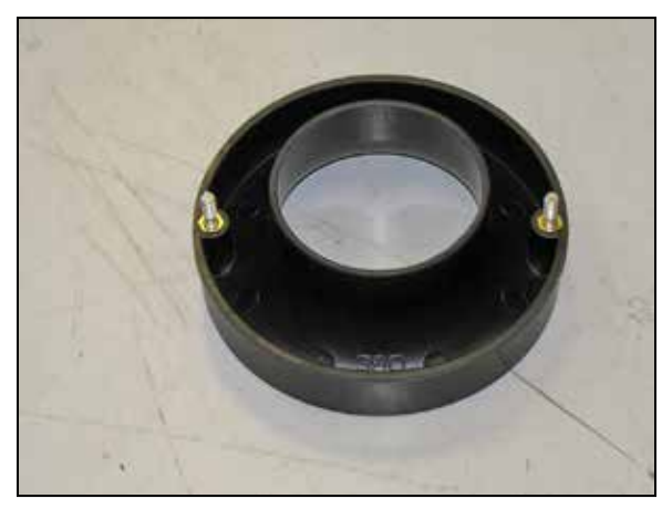
13. Install the two provided 6mm studs into the radius filter adapter as shown.

NOTE: the two upper air filter housing bolts will not be reused and the locations left blank.