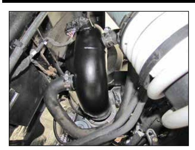
22. Install the K&N® intake tube into the coupling hoses, align for best fit and then secure with the provided hose clamps. Reconnect the inlet temperature sensor electrical connection and connect the BOV hose and crank case breather hoses. Secure the hoses with the provided hose clamps.